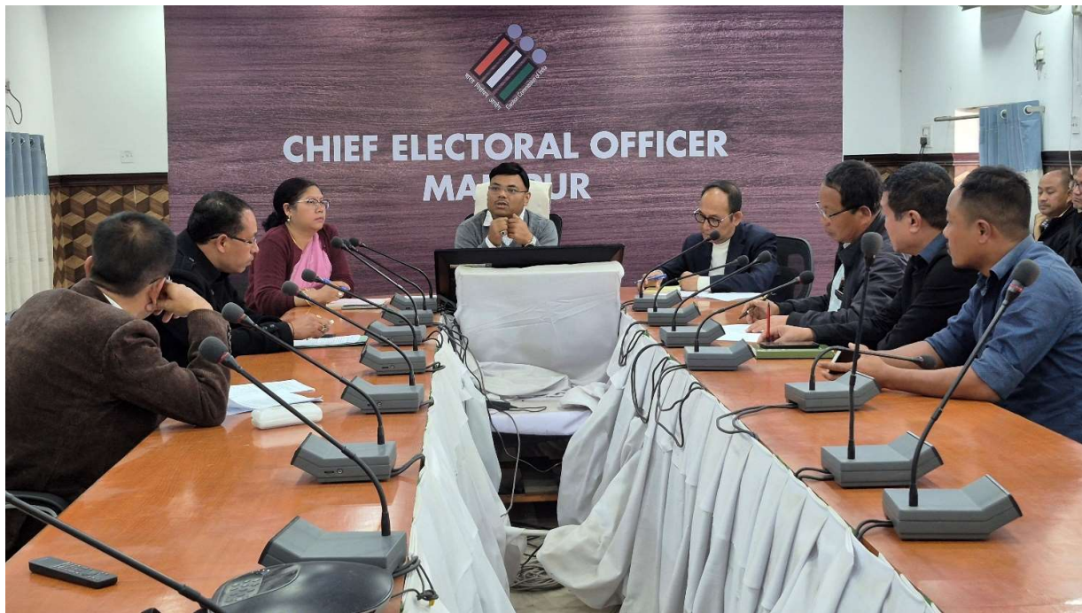
Meeting with National and State Political Parties with regards to draft Electoral Roll publication of 49-Tadubi (ST) Assembly Constituency